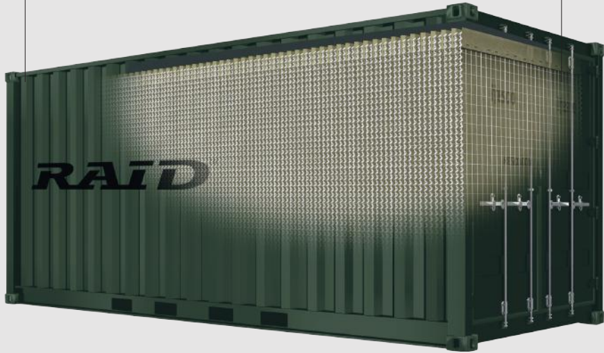
Pre-connected lengths of MIL units